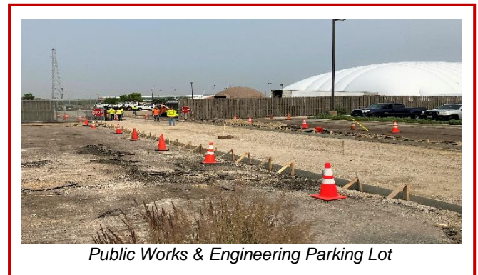
Public Works & Engineering Parking Lot