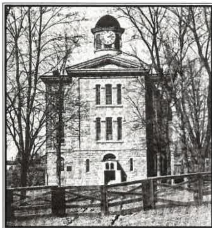
Original Central School Building built in 1857 Destroyed by fire in 1895. The current Central Square building stands on the same land.