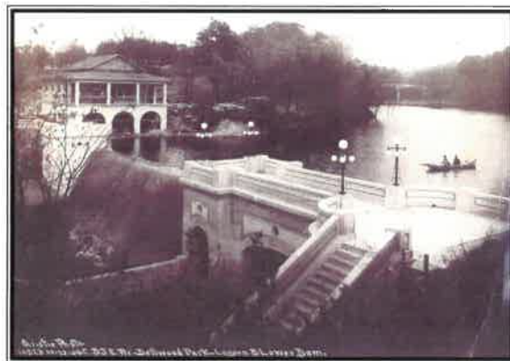
Lake, Dam and Boathouse at Dellwood Park, 1906.